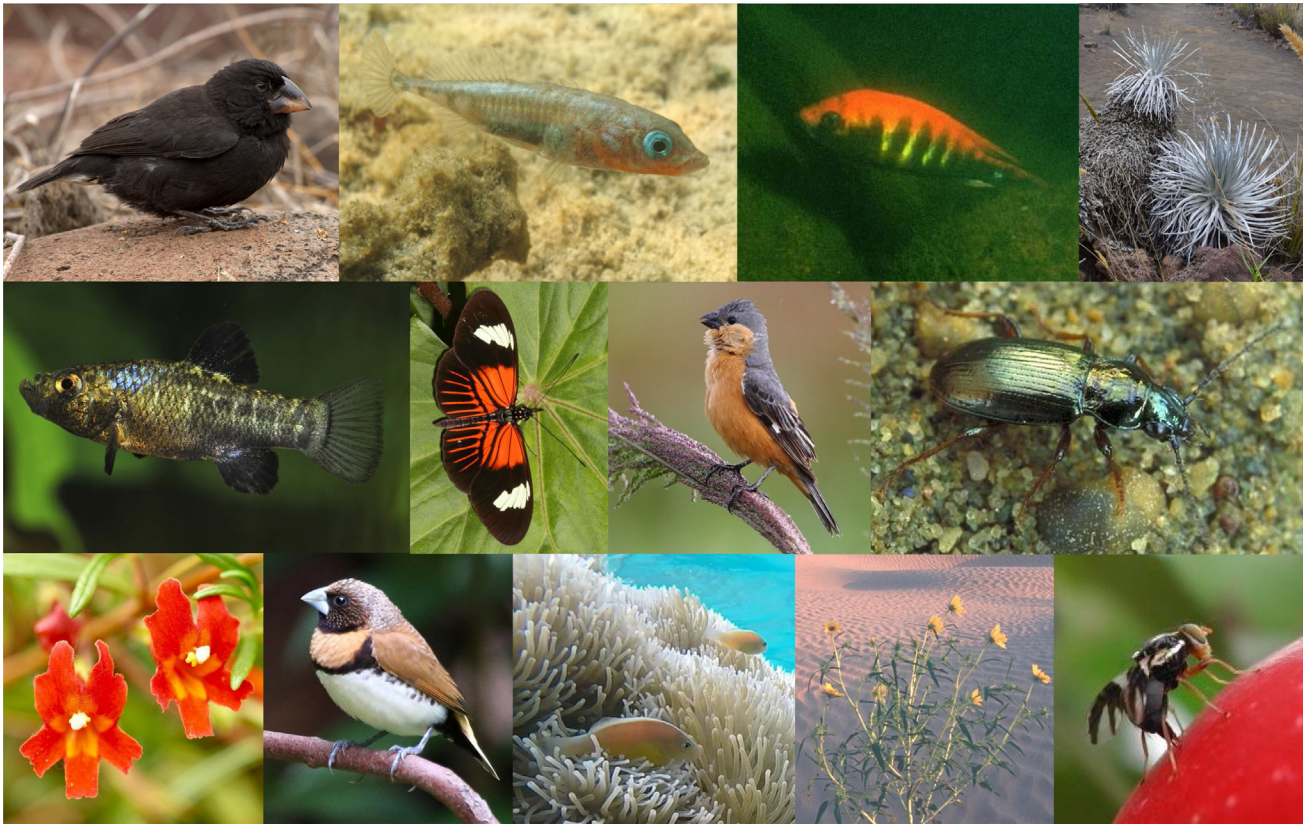
Trends in Ecology &amp; Evolution

Figure 1. Examples of Species That Arose from New Combinations of Ancient Alleles. From left to right, top to bottom: Darwin finch ( Geospiza conirostris,), freshwater stickleback ( Gasterosteus aculeatus,), Lake Victoria cichlid ( Pundamilia nyererei,), Hawaiian silversword ( Argyroxiphium sandwicense,), scale-eater pupfish ( Cyprinodon desquamator,), Heliconius butterfly ( Heliconius timareta,), capuchino seedeater ( Sporophila hypoxantha,), short-winged Pogonus beetle ( Pogonus chalceus,), red monkeyflower ( Mimulus aurantiacus ssp. puniceus,), munia ( Lounchura castaneothorax,), clownfish ( Amphiprion akallopisos,), Helianthus sunflower ( Helianthus deserticola,), and apple fly ( Rhagoletis pomonella,).